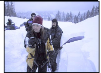
Snow Profile / Stability Tests

A Release of Liability must be signed before participating in any program.